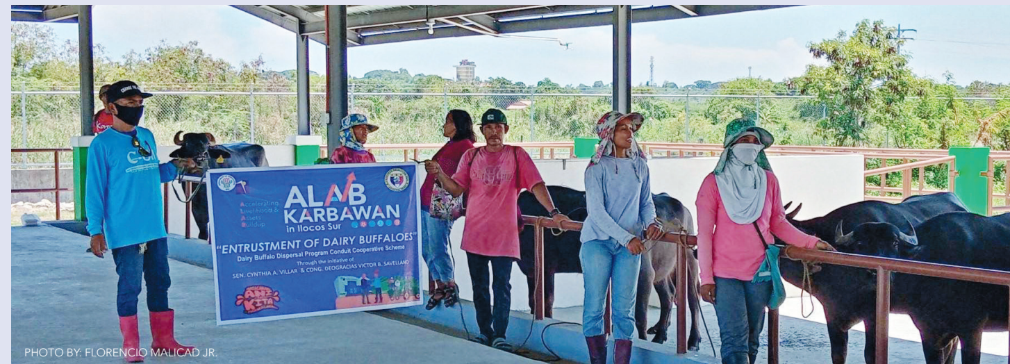
Select members of Nueva Segovia Consortium of Cooperatives (NSCC) receive dairy buffaloes and one breeding bull as part of the Carabao-based Business Improvement Network (CBIN) project called ALAB Karbawan.

Aside from NSCC, the Northern Ilocos Sur Agricultural Cooperative (NISAC) in barangay Baclig, Cabugao, Ilocos Sur, which received 16 female dairy buffaloes in November last year, is also a conduit cooperative under ALAB Karbawan.